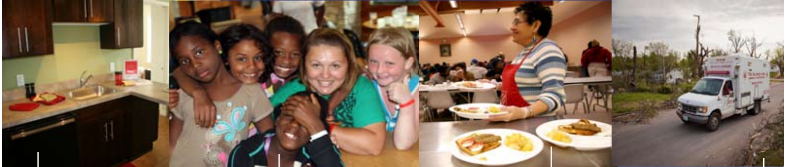
Affordable housing & shelter